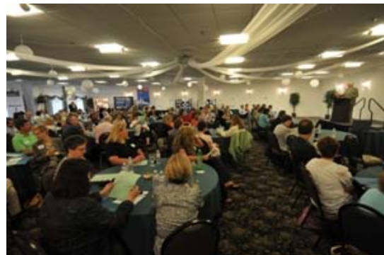
Some of the capacity crowd at the Mental Health Matters in the Workplace Conference.